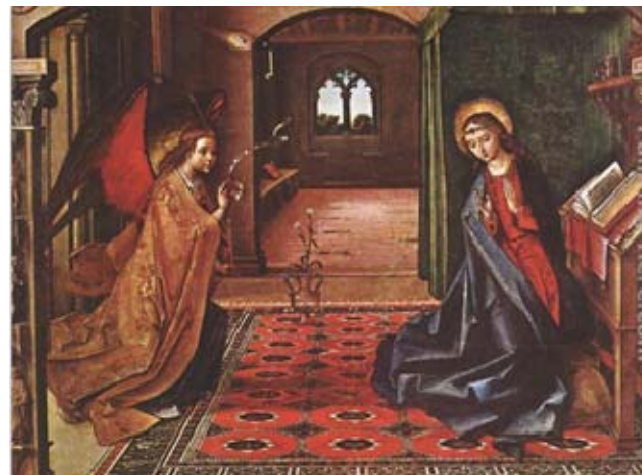
The Annunciation Pedro Berruguete (1450-1504)

December 10, 2017 Second Sunday of Advent