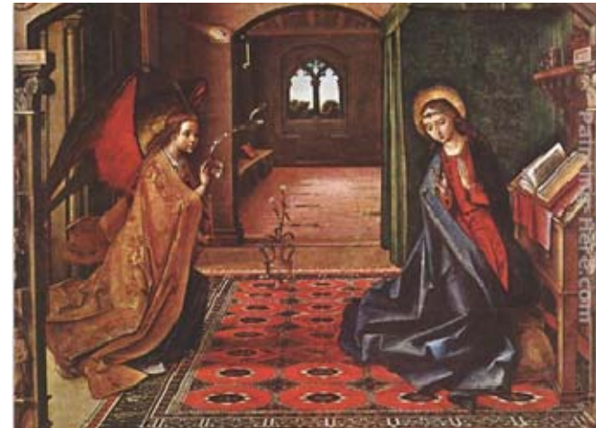
The Annunciation Pedro Berruguete (1450-1504)

December 10, 2017 Second Sunday of Advent